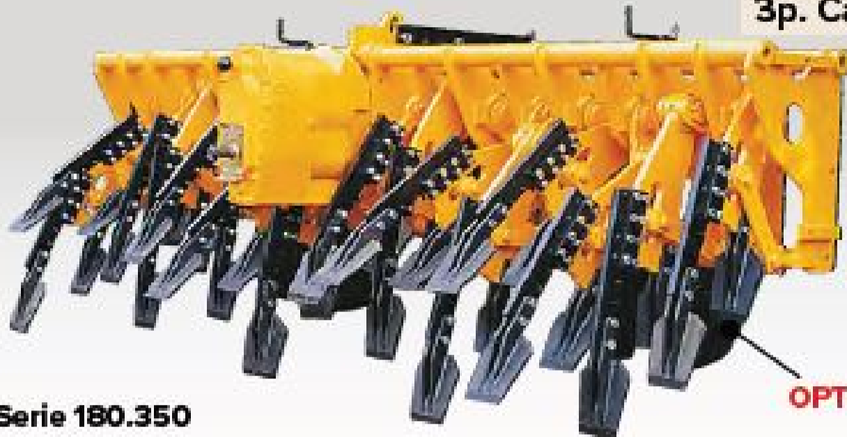
4516 Serie 180.350