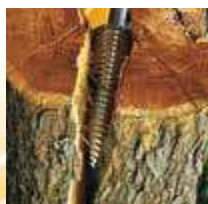
CONO - Cone - Cône - Cono - Kegel

Mod. Cod. PC 10 (10 cm./4 inc.) PC 15 (15 cm./6 inc.) PC 20 (20 cm./8 inc.)