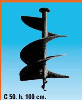
C 50. h. 100 cm.