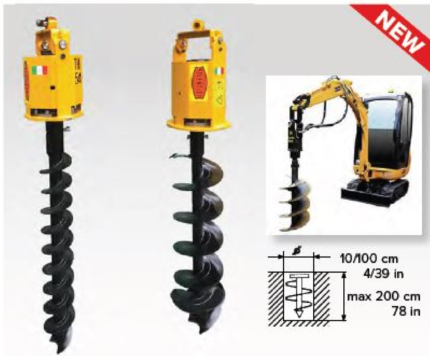
TH54 e TH56

HYDRAULIC POST HOLE DIGGERS | TARIÈRES HYDRAULIQUES AHOYADORES HIDRÁULICOS | HYDRAULISCHE ERDBOHRER