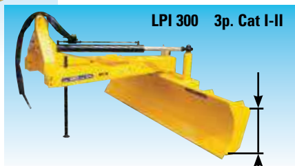
LPI 300 3p. Cat I-II